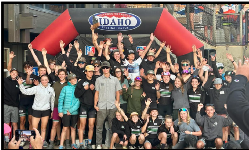
Wood River Mountain Bike Team of 2023 takes 2nd place!

Team placement for Division 1: 1 - Boise Brave Mountain Bike Team; 2 - Wood River High School; 3 - Teton Valley Composite; 4 - Highland High School; 5 - Jackson Hole Composite; 6 - McCall Area Composite Mountain Bike Team; 7 - Timberline High School; Canyon County Composite Cycling; 9 - Centennial High School; 10 - Eagle High School