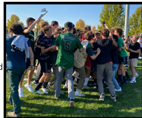
Above: Students celebrate with team right after game. Below: Team picture at home

Congratulations to our boys' soccer team for their well-deserved championship win!